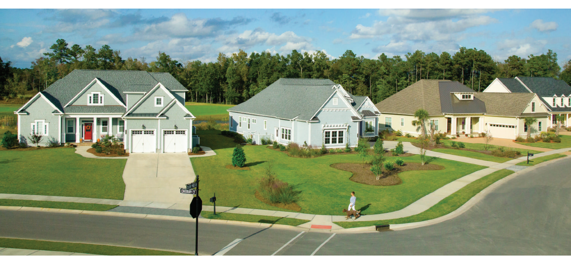
Handsome custom homes line the namesake golf course in Brunswick Forest's upscale Cape Fear National neighborhood.