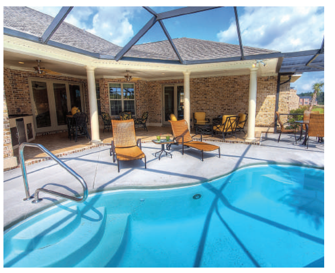
Just across from the entrance to the Cape Fear National clubhouse, Banyan Bay is a gated enclave of Floridian-inspired homes, with fabulous pools, lush landscaping and extensive summer kitchens. The interiors, too, bring lavish tropical hideaways to mind. Home packages from the $400s.