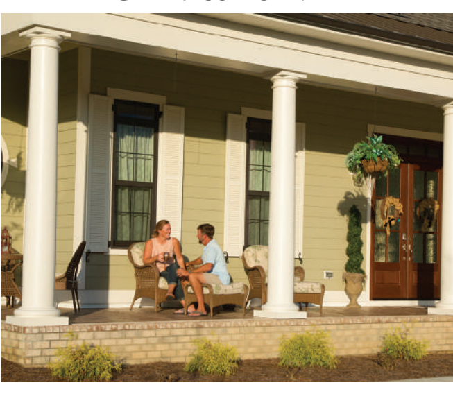
Inspired by the graciousness of many historic Southern towns, Cypress Pointe is a salute to classic coastal Carolina architecture. It's an atmosphere of casual sophistication, where that famous regional hospitality is emphasized and embraced. Home sites from the $100s; home packages from the $400s.