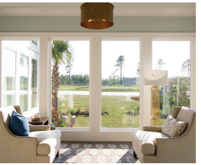
With its namesake championship course as its centerpiece, Cape Fear National is the fairest of neighborhoods. These larger home sites have fabulous views of signature holes or natural backdrops that include water or wooded protected areas. Home sites from the $130s; home packages begin in the high $400s.