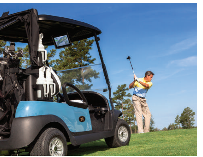
GPS-equipped carts give residents a resort experience on their home course.

Do you dream of a tropical backyard retreat centered around a refreshing pool, a luxurious lanai and a gourmet summer kitchen? Is a Southern manor more your style, where sweeping porches are marked by stately columns and rocking chairs for family and neighbors? Perhaps your heart desires to work with an architect to create the stunning masterpiece that (for now) exists only in your imagination.